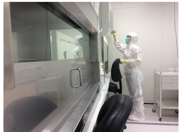
One of Regeneus' researchers in the room where Progenza is made.